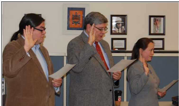
OUR NEW TRIBAL SUPREME COURT